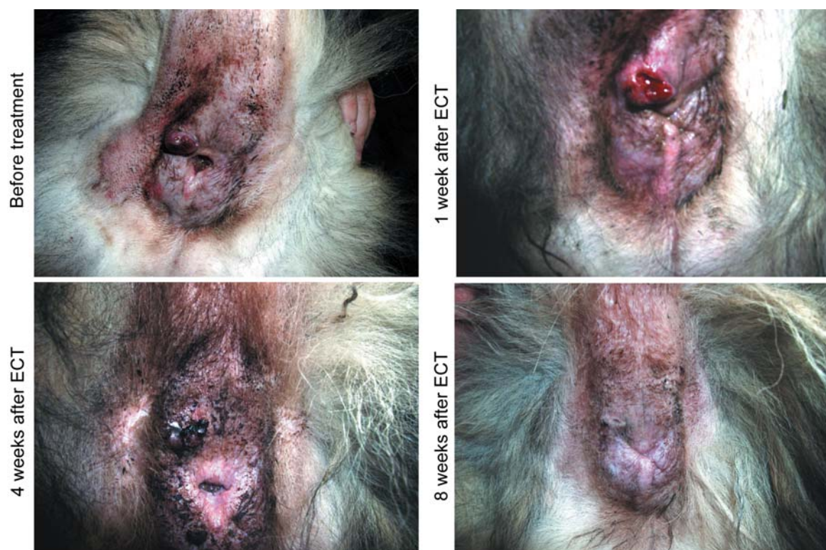
Figure 1. Antitumor effectiveness of electrochemotherapy (ECT). Subject 3 was treated 2 times by ECT with cisplatin at 4-week intervals. Good local control was obtained 8 weeks after the first ECT session.